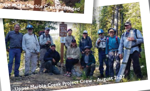
Upper Marble Creek Project Crew - August 21-27