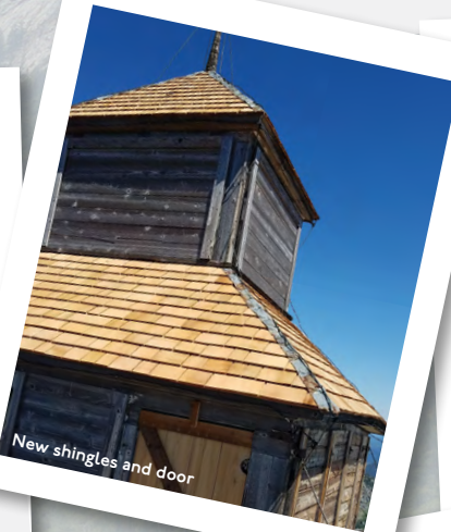
New shingles and door