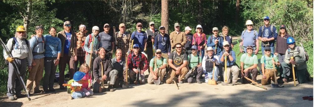
National Trails Day 2018

WHEN: Saturday, June 1 9am WHERE: Sweathouse Creek - Victor, MT RATING: Very Easy