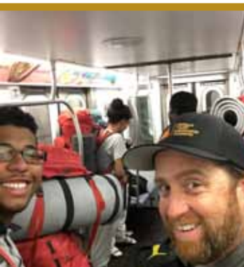
from subway to solitude-westward ho!